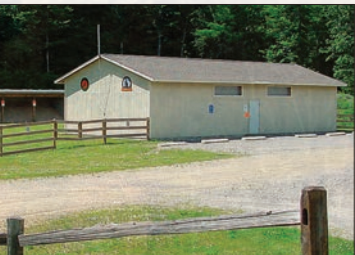
Small bore (rifle) range

The center hosts workshops, group programs and special events, many free of charge.