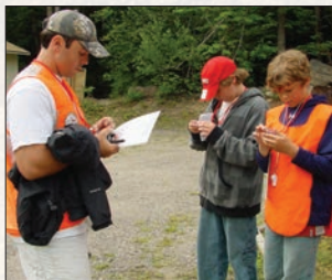
Map and compass instruction

The "hands-on" and "learn by participation" approach is the focus at Owl Brook.