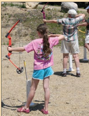
Try archery – fun for the whole family!

Many facilities are open to the general public. A 4-target archery practice area and self-guided interpretive trails are open during center hours. A 14-target woodland archery course is open daily from dawn to dusk.