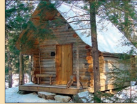
Trapper cabin, donated by N.H. Trappers Association